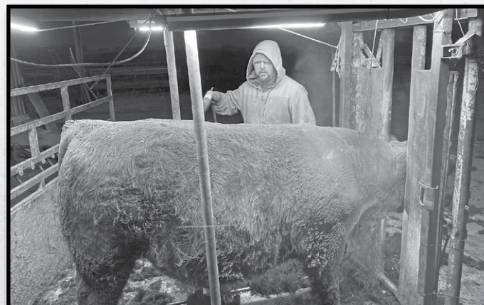
Clipping the bulls late into the evening in sub-zero temps.

Dam's Production: BW WW 2/93 2/107 Heifer Bull