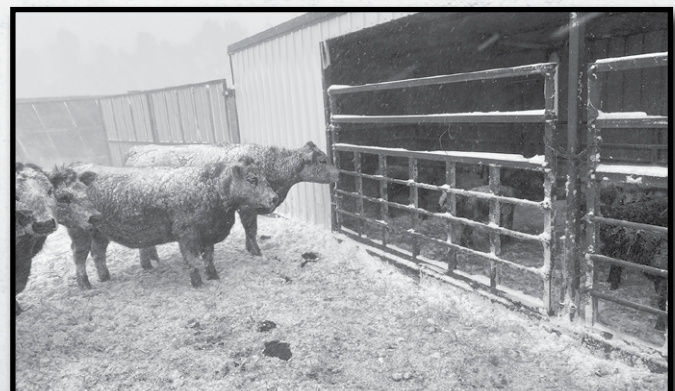
First calf heifers and calves in a blizzard.

Dam's Production: BW WW 4/101 4/100 Heifer Bull