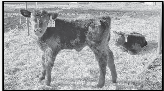
2021 Coalition heifer calf